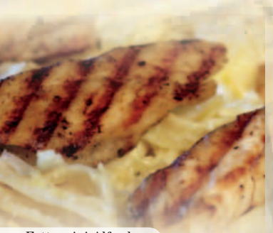
Fettuccini Alfredo with Chicken

Hot Italian Luca Roll Sliced ham, sliced salami, provolone, mozzarella & fresh tomato layered & baked in our pizza dough