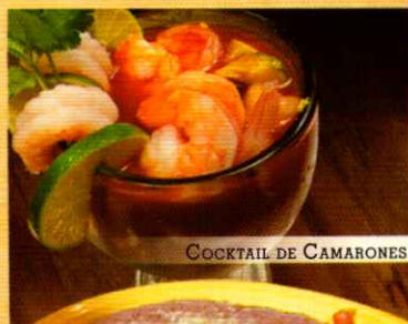
COCKTAIL DE CAMARONES

Grilled chicken breast topped with onions, mushrooms and cheese sauce. Served with rice, salad and tortillas - 9.99