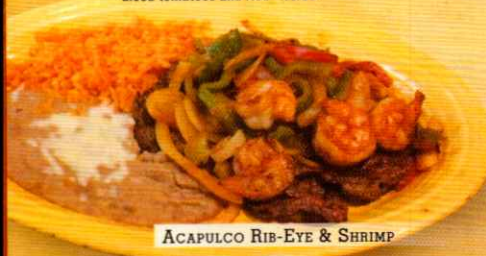
ACAPULCO RIB-EYE & SHRIMP

Grilled rib-eye steak topped with grilled green peppers, onions and tomatoes. Served with lettuce, guacamole, diced tomatoes and rice - 13.99