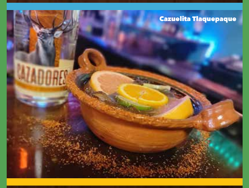
Locations in Greenwood and Lafayette

The Bravo Family invites you to enjoy our new menu. Serving Mexican kitchens for over 4 decades. We take pleasure to prepare the best quality food for you.