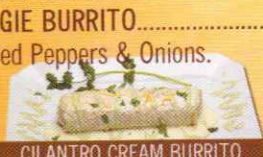
CILANTRO CREAM BURRITO