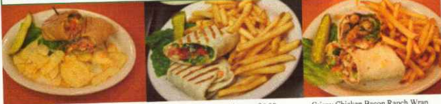
Buffalo Chicken Wrap with chips... $7.15 BLT Wrap with chips..... $6.99 Crispy Chicken Bacon Ranch Wrap with chips $7.15